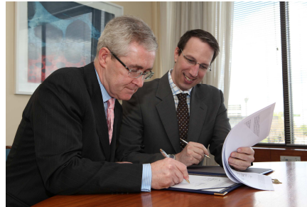
UCD signs Memorandum of Understanding with IMPACT