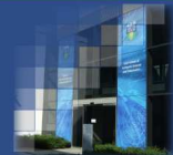
CCI Organisational Structure