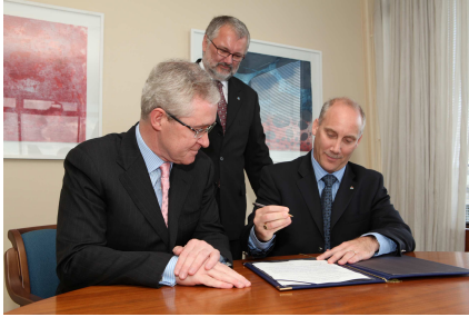
UCD signs Memorandum of Understanding with Interpol

Memoranda of Understanding – signed 27 th April 2009